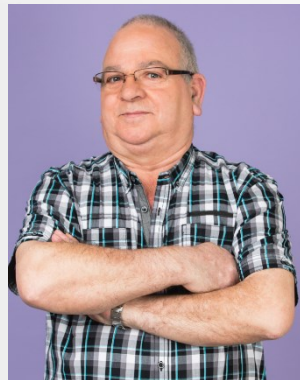
Antonio RODRIGUES Photocopies